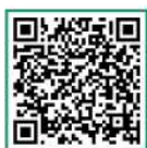
Course Taking and Cross-institutional Course Enrolment Scheme

A student and his/her supervisor should from the outset of the MPhil/PhD study discuss and agree on a provisional thesis topic and the coursework to be taken if necessary. A student may be required to take some undergraduate/postgraduate course(s) or courses listed under a collaborative scheme established by the eight universities in Hong Kong in order to strengthen his/her academic background.