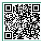
Additional Requirements for Business

In particular, the PhD in Business programme has set additional requirements such as passing a candidacy examination and meeting coursework requirements. Details are available from the University website ( www.LN.edu.hk/sgs/docs/pgrad/add-phdbus.php ).