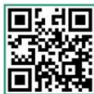
On-campus Student Hostels

^ subject to the renewal arrangement with JTIA for the 2022-23 academic year and onwards