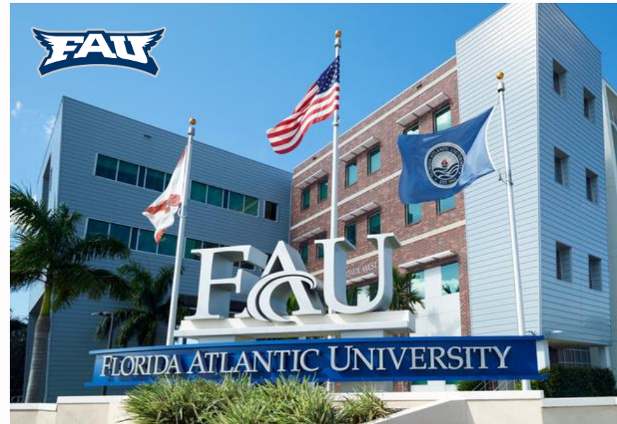
Florida Atlantic University