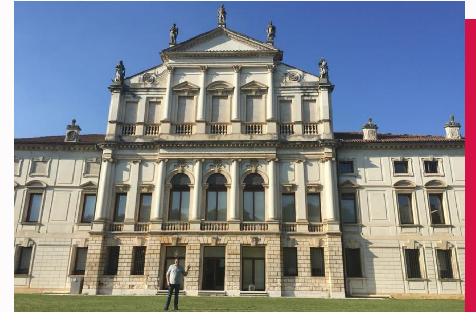
CUOA Business School