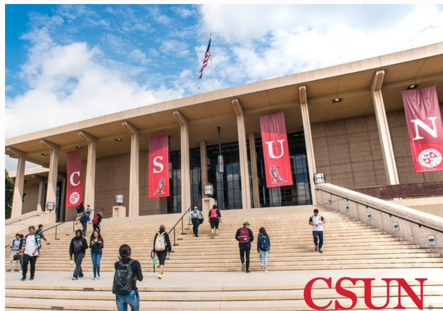
California State University