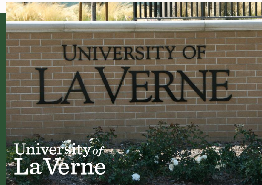
University of LaVerne