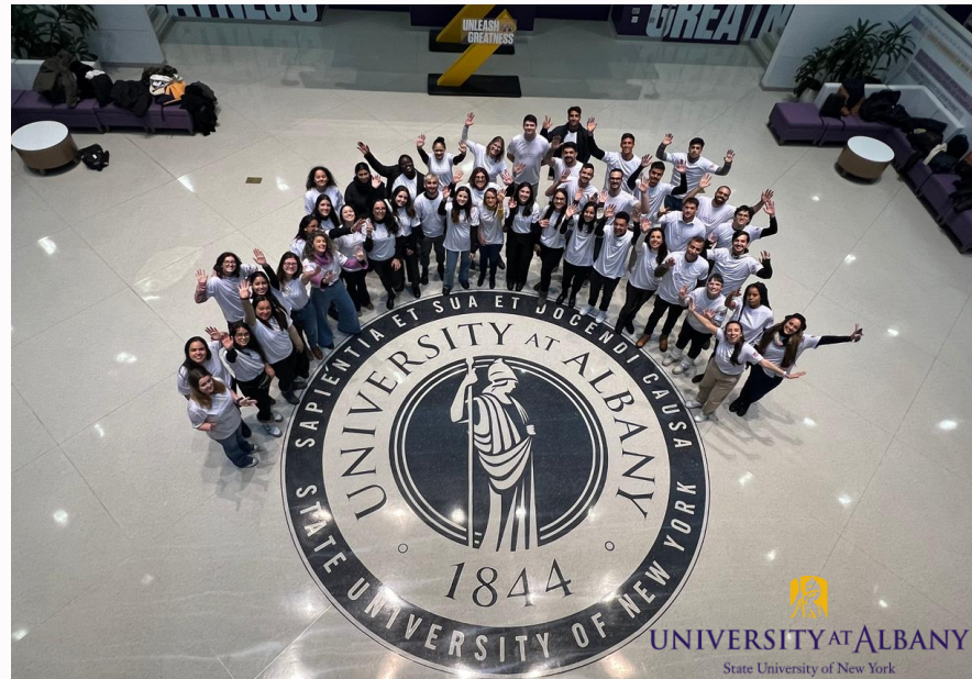
State University of New York