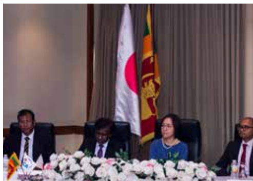
JICA Chair Programme Closing Ceremony - 2022

With the concept of internationalization of University of Peradeniya, the International Relations Office is in its journey of enhancing global Relations, promotes multidisciplinary collaborative research programs, and facilitating students and staff members with resources and providing platforms to scholarly exchanges.