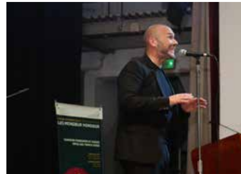
Francophonie - 2023