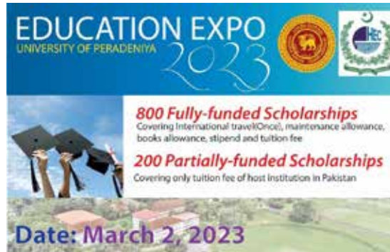
Education Expo - 2023