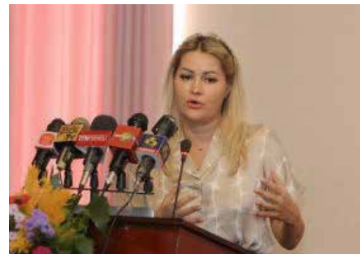
Russian Day of the University of Peradeniya