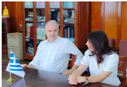
Visit of Greek Ambassador