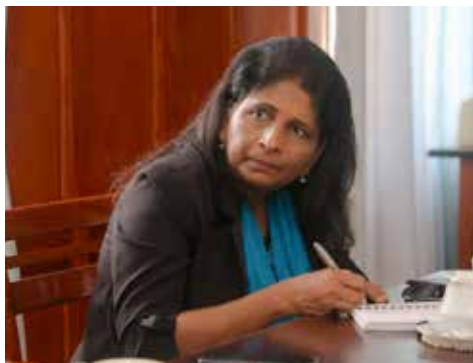
Meeting with Fulbright Commission

With the concept of internationalization of University of Peradeniya, the International Relations Office is in its journey of enhancing global Relations, promotes multidisciplinary collaborative research programs, and facilitating students and staff members with resources and providing platforms to scholarly exchanges.