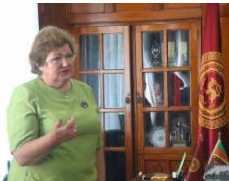
Meeting with the Gomel State Medical University

With the concept of internationalization of University of Peradeniya, the International Relations Office is in its journey of enhancing global Relations, promotes multidisciplinary collaborative research programs, and facilitating students and staff members with resources and providing platforms to scholarly exchanges.