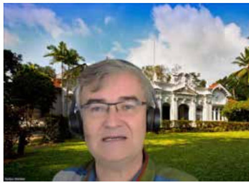
Meeting with Goethe Institute, Colombo