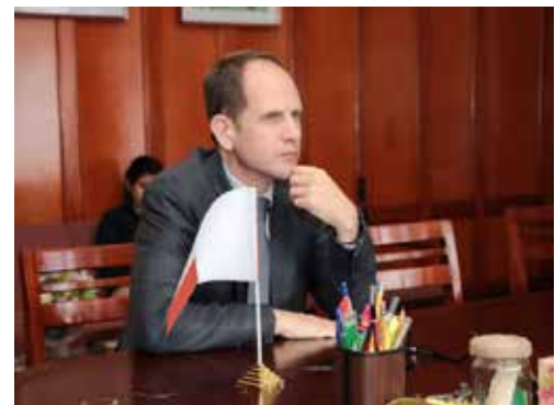
Visit of the High Commissioner for Canada in Sri Lanka and Maldives