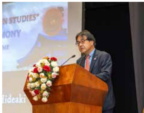
JICA Chair Programme - Inauguration Ceremony