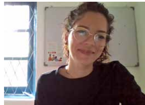
Meeting with Alliance Française, Kandy