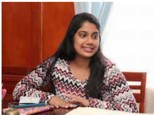
Meeting with Regional Officer of DAAD

With the concept of internationalization of University of Peradeniya, the International Relations Office is in its journey of enhancing global Relations, promotes multidisciplinary collaborative research programs, and facilitating students and staff members with resources and providing platforms to scholarly exchanges.