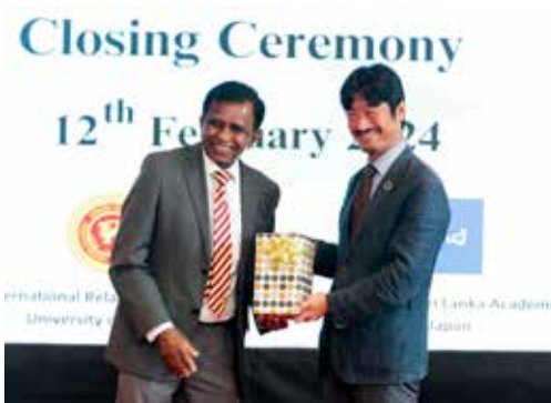
The Closing Ceremony of the Japan's Modernization Studies - JICA Chair Programme - 2023

With the concept of internationalization of University of Peradeniya, the International Relations Office is in its journey of enhancing global Relations, promotes multidisciplinary collaborative research programs, and facilitating students and staff members with resources and providing platforms to scholarly exchanges.