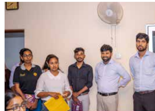
Women's Day Programme in collaboration with the Assistant High Commission of India, Kandy